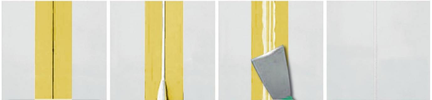
Protect the front of the sheets with adhesive tape to prevent staining.

It is made with Macroseal sealant using a double piston gun. Leaving a 2-3 mm gap between the sheets and protecting the sheets with isolating tape from excess of Macroseal sealant (A+ and bactericide classification).